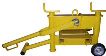
ZQ330 & ZQ430G