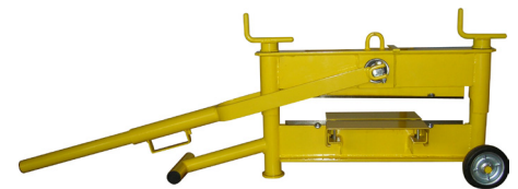
ZQ530L & ZQ650L