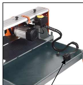
Water trough with integrated pump for cooling water supply