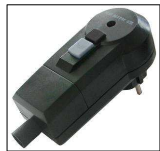
RCD plug for machine safety