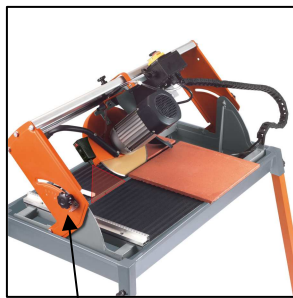
Ininitely swiveling motor guide from 0°-45°