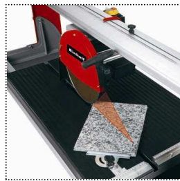
Angle-perfect adjustable angle stop for exact cutting