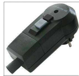
RCD-plug for machine safety