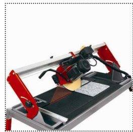
Infinitely swivelling motor guide from 0°/45°