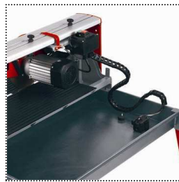
Water trough with integrated pump for cooling water supply and drain plug